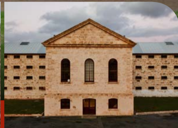
ABOVE: Connors Mill, Toodyay